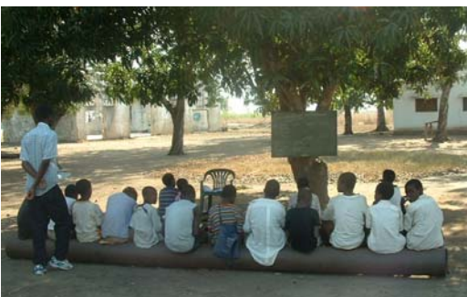
Literacy Class in rural Africa

Planet Aid is recognized by the IRS as a 501 (c)(3) organization. Donations to Planet Aid are tax deductible; IRS Tax ID # 04-3348171.